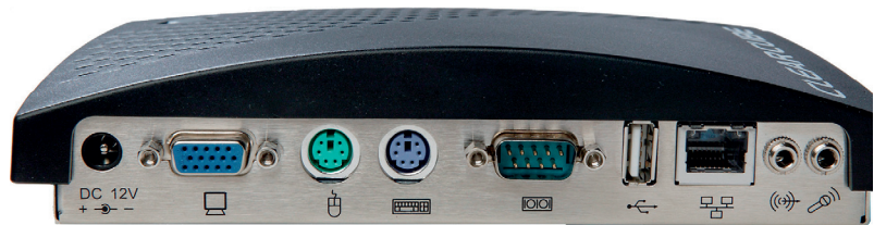
I8820 Connection View