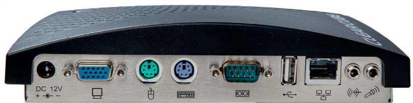
I8020 Connection View