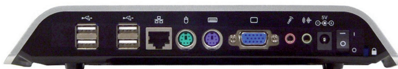
I8330 Rear View